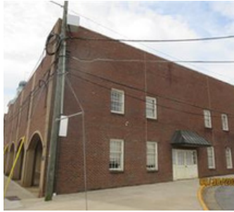
115 N 6th Street

Contact Realtor for lease pricing Contact: Anna Kham 770-224-9996