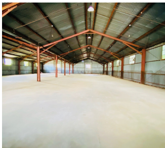
301 W. Solomon Street

Contact Owner for lease pricing Contact: Ateer Sheth 404-642-0259