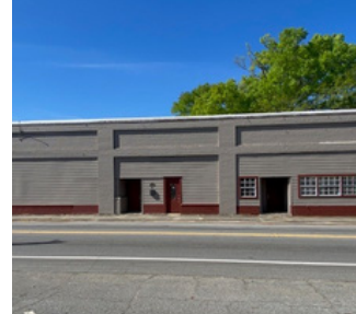
702 Experiment Street

$4,500 per month Contact: Kathy Slade 770-468-1157