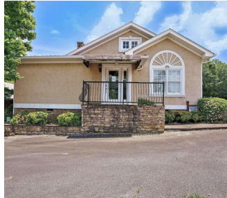
914 W. Taylor Street

Contact Owner for lease pricing Contact: Ateer Sheth 404-642-0259