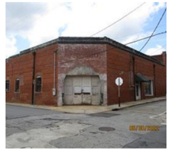
115 State Street

Contact Realtor for lease pricing Contact: Rachel Whitman