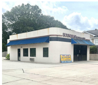
910 W Taylor St,

Contact Owner for lease pricing Contact: Ateer Sheth 404-642-0259