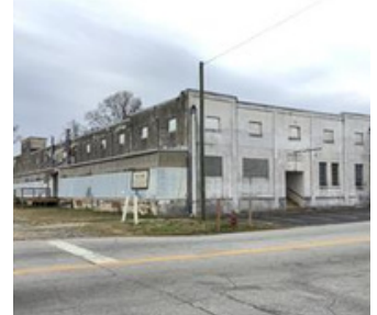
323 W. Solomon Street