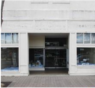
135 S. Hill Street