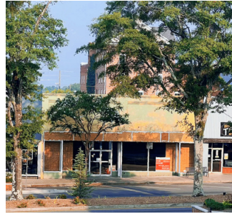
115 S. Hill Street

Contact Realtor for lease pricing Contact: Singletary Realty 770-468-1332