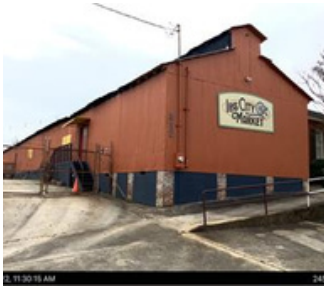
301 W. Solomon Street